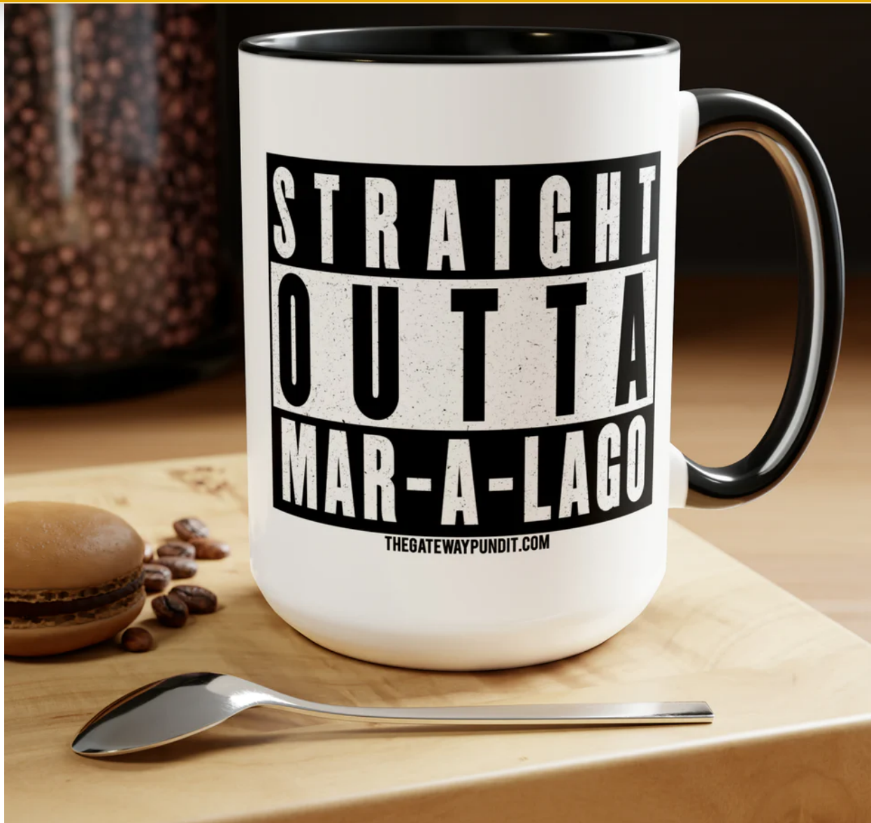
Straight Outta Mar-A-Lago Coffee Mug, 15oz