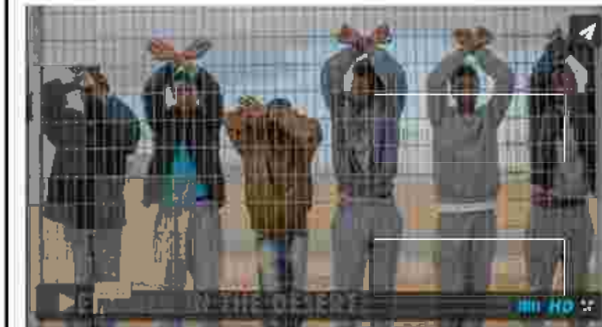
Refugees Detained in Israel's Desert from Jewish Daily Forward 2015/12/01

Israel's Parliament has passed a new law aimed at keeping African immigrants behind bars — and a controversial jail to house them — by year's deadline says the country's highest court.