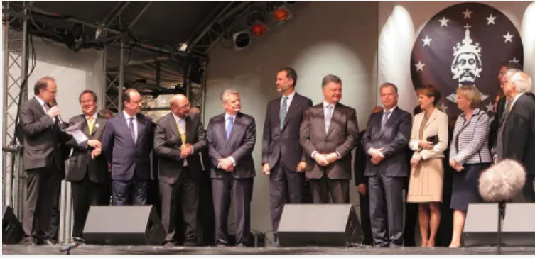
The Charlemagne Prize 2015 being awarded to President of the European Parliament Martin Schulz

It might be an idea for our rarely heard of MEP's to start asking EU Parliament supporters of the Charlemagne Prize why it is that they give such a prestigious prize every year in honour of such a racist supremacist genocidal maniac as Richard von Coudenhove-Kalergi.