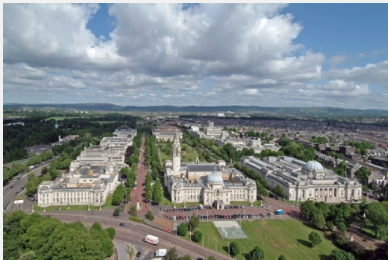
Cardiff's (Capital of Wales) distinguished Civic Centre

I'm proud of my country of Wales. I'm proud to be from a spirited country that isn't afraid to fight for its right to exist in a world of diverse, beautifully different nations on earth.