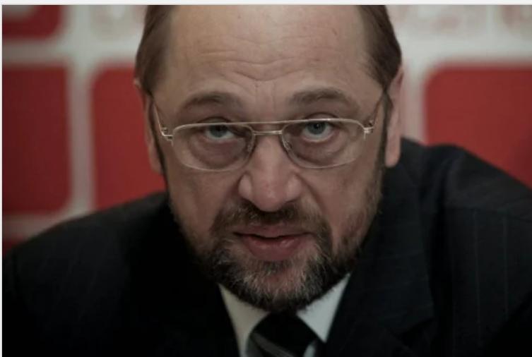
Former president of the European Parliament Martin Schulz

When the numbers are disproportionate, unnaturally forced or out of control, there will inevitably be tensions and effects on jobs and wages, on public services and on society at large. Nobody wins. Racial incitement to hatred and extremism from across the whole political spectrum should be tackled whenever it occurs. But the racism of those political leaders that deliberately inflict disproportionate mass migration on any country without the agreement of that country and its people should be tackled equally.