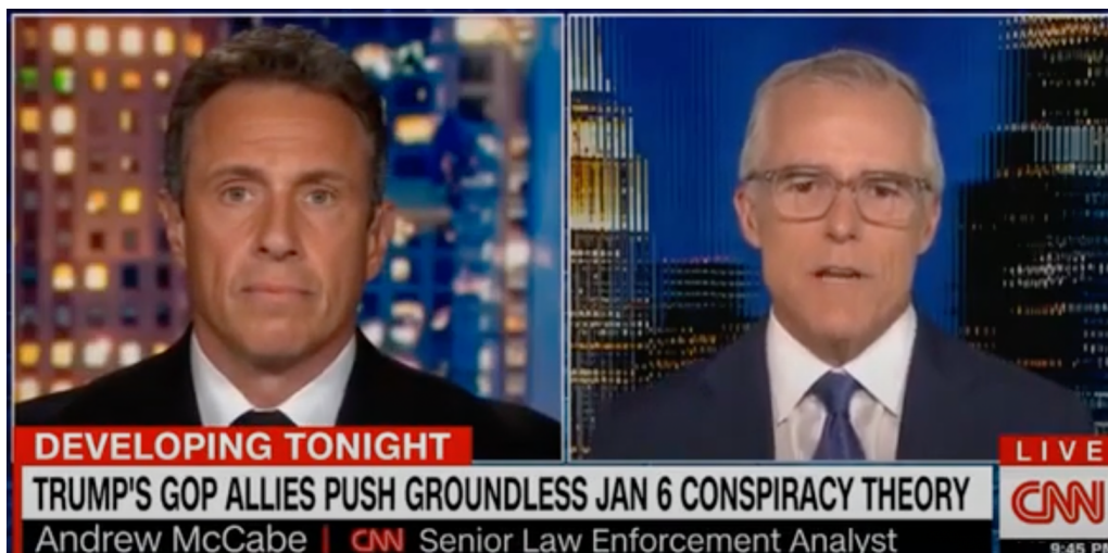
CNN, June 16, 2021, with scandal-plagued anchor Chris Cuomo and disgraced former FBI Deputy Director Andrew McCabe

The axis of liberal media outlets and their allied activist groups — CNN , NBC News , The Washington Post , Media Matters — are in an angry uproar over a recent report questioning the foreknowledge and involvement of the FBI in the January 6 Capitol riot. As soon as that new report was published on Monday, a consensus instantly emerged in these liberal media precincts that this is an unhinged, ignorant and insane conspiracy theory that deserves no consideration.