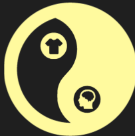
The AFRU Justice Spiral™

Shalawam! 🙌 AFRU is a Black-led and Black-owned startup that combines art and fashion with lifestyle commentary to create a strong social justice brand that is relevant to folks from all walks of life.