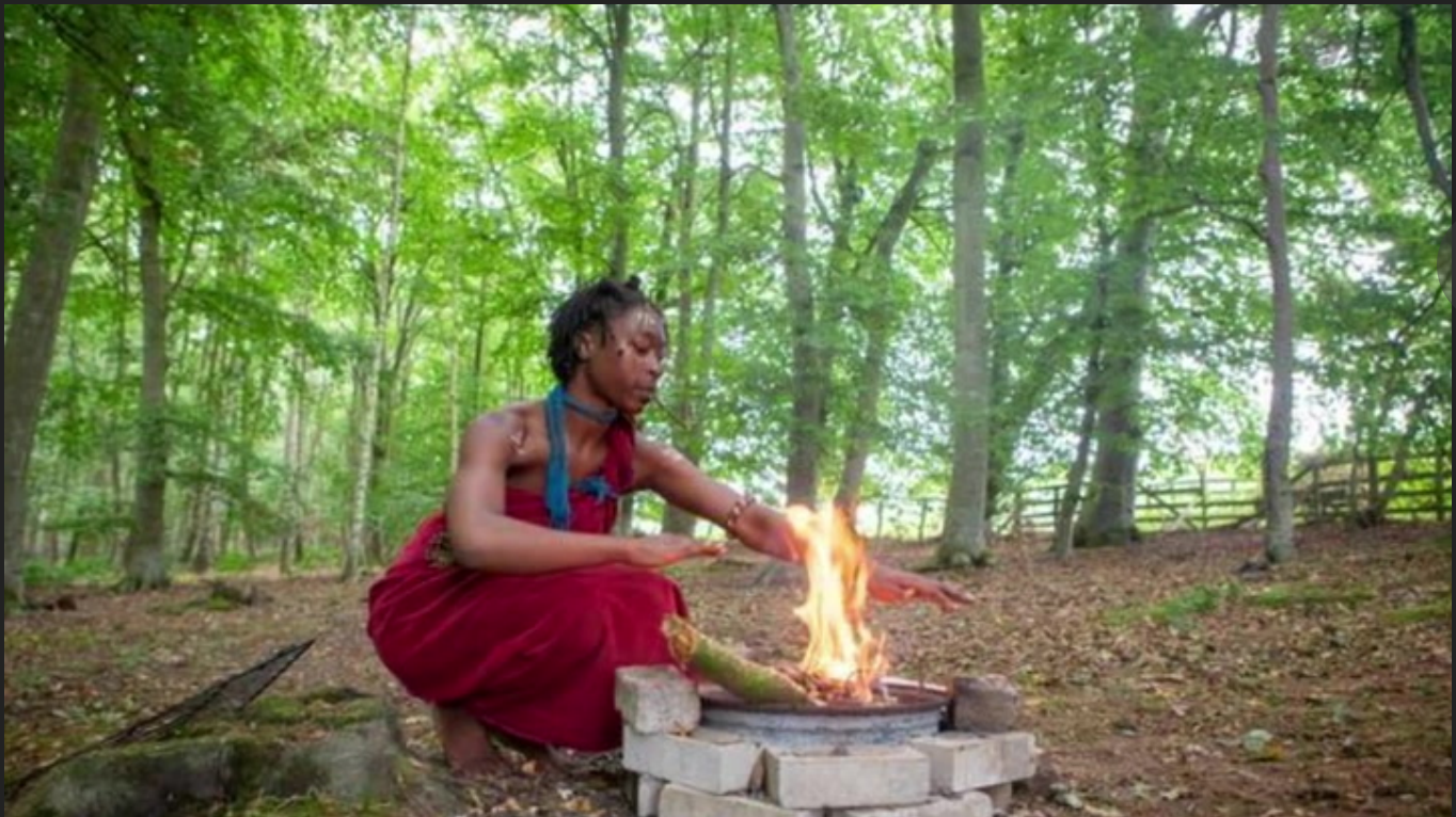
Missing Texas woman found living among lost ‘African’ tribe in Scotland