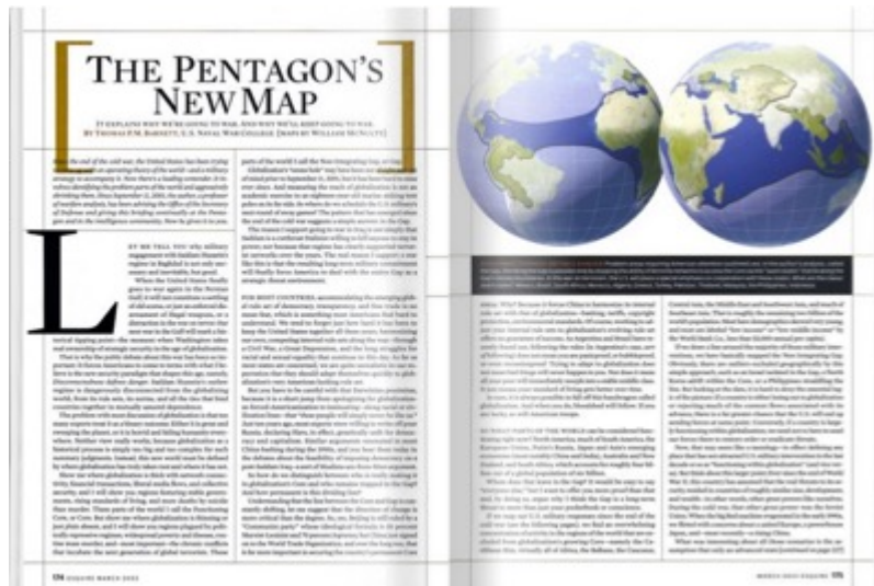
Esquire Magazine, March 2003

It doesn't matter if allied governments interpret these wars in accordance with the US communication: they are not civil wars, but stages of a plan preestablished by the Pentagon.