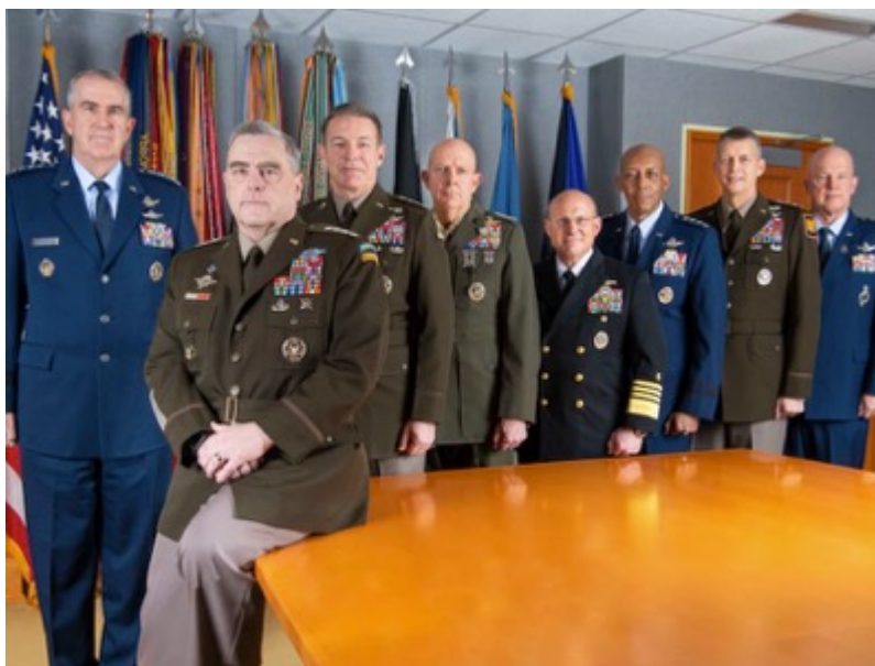
The eight members of the Joint Chiefs of Staff.

The Pentagon has repeatedly tried to extend the "Rumsfeld/Cebrowski doctrine" to the Caribbean Basin. It planned an overthrow, not of the Nicolás Maduro regime, but of the Bolivarian Republic of Venezuela. It finally postponed this.