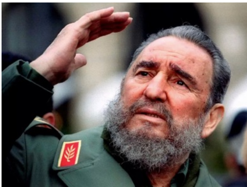
Fidel Castro, the commander of the Cuban Revolution, defended Thierry Meyssan's work.