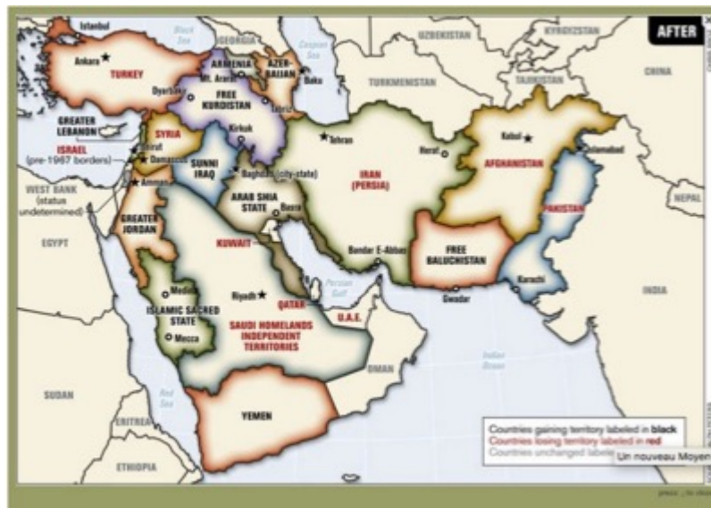
The maps of the US Joint Chiefs of Staff in 2001, published in 2005 by Colonel Ralph Peters, still guide the actions of the US military in 2021.

I n my book L'Effroyable imposture [1] [2], I wrote, in March, 2002, that the attacks of September 11 were aimed at making the United States accept :